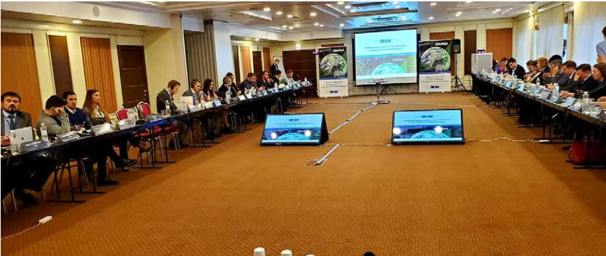
First CyberEast steering committee, 13-14 February 2020 in Kiev, Ukraine

and to support the set-up of a new national CERT. In Belarus, assisting the development of a national cybersecurity strategy document may not be feasible due to the relatively narrow timeframe, and because the nature of the topic is politically charged. However, together with stakeholders in Minsk and the national CERT, a number of priorities in line with project objectives has been identified. The latter comprise, for example, a cyber hygiene campaign and support to the technical capacity of existing and sectoral CERTs yet to be established.